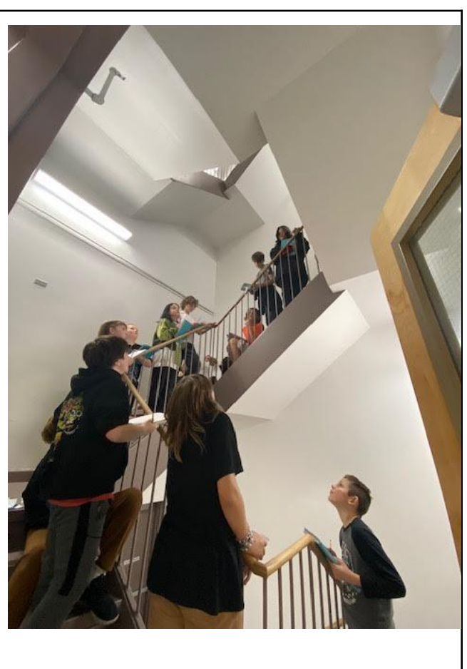
Grade Six Science - Flight