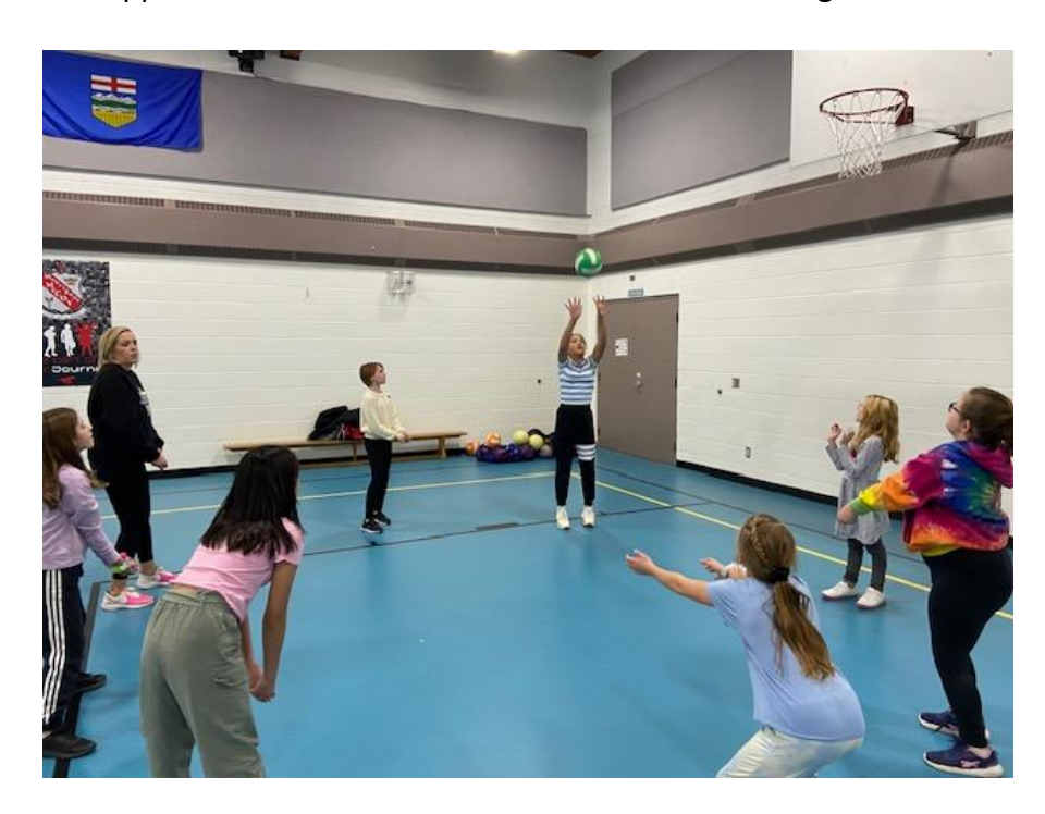
College Program Ever Active Schools