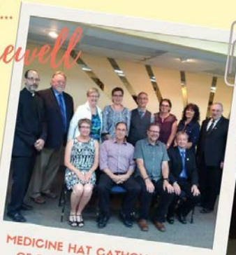
MEDICINE HAT CATHOLIC BOARD OF EDUCATION RETIREES 2017

Thank you for your commitment, dedication and faith-filled service.